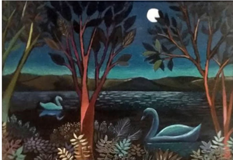
Credit: Gene Skala, "Blue Swan, Night Swan," 2015, Oil on panel, Courtesy of the Artist

S torytelling by lantern light under a giant copper beech.