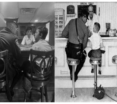
(this medium allows teacher and around the house to create a creativity, such as by recreating live versions of

where we've seen our stustudent to dialogue directly on color wheel, sketching their famous artwork. assignment), through live own house, or creating a digi-